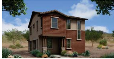
V – Shown with Optional Brick