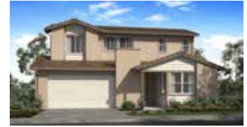
D: Mid-Century Modern

Two Story • 2,479 Sq. Ft. • 4-5 Bedrooms • 3 Baths Great Room • Kitchen with Island • Dining • 2-Bay Garage