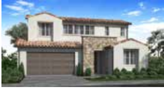
A: Modern Spanish