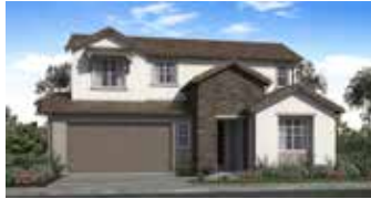
B: Wine Country