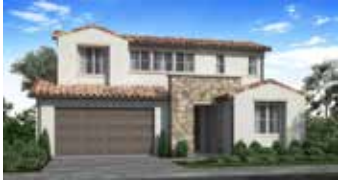
A: Modern Spanish