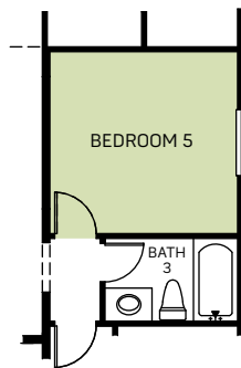
OPT. BEDROOM 5