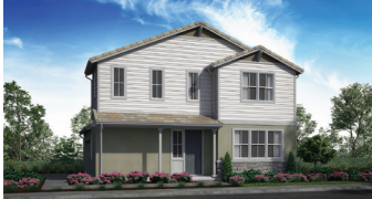
A: Modern Spanish