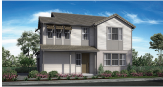
B: Wine Country