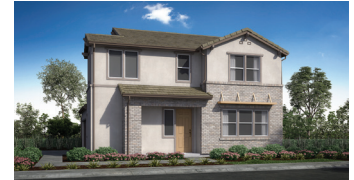
C: Modern Prairie

Two Story • 1,745 Sq. Ft. • 3 Bedrooms • 2.5 Baths Great Room • Kitchen with Island • Dining • 2-Bay Garage