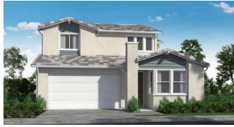
B. Mid-Century Modern