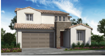
A. Modern Spanish