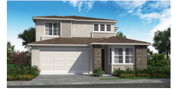
C. Modern Prairie

Two Story • 1,961 Sq. Ft. • 4 Bedrooms • 3 Baths Great Room • Kitchen with Island • Dining • 2-Bay Garage