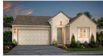
C: European Country