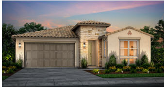
A: Mediterranean Revival