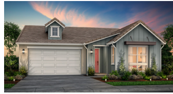
B: Farmhouse Victorian