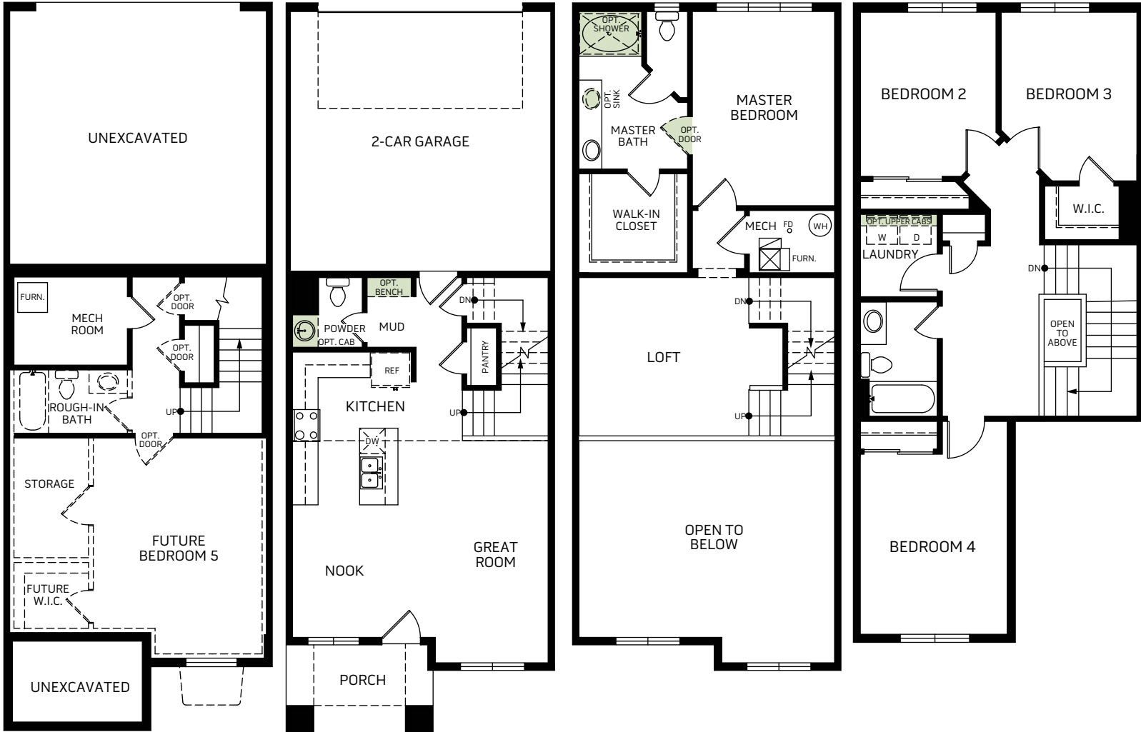
BASEMENT 583 Sq. Ft.

Three-story • 2,109 Finished Sq. Ft. • 2,692 Total Sq. Ft. • 4-5 Bedrooms • 2.5-3.5 Baths • Great Room • Loft • Walk-In Closet & Mud Room • 2 Car Garage