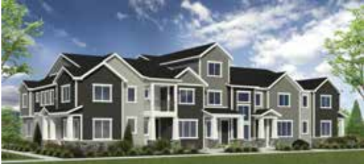
5 PLEX B