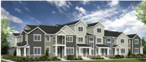
6 PLEX B