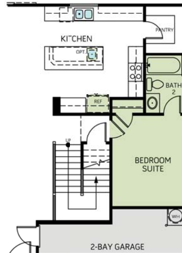
OPTIONAL BEDROOM SUITE IN LIEU OF TANDEM GARAGE