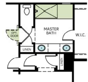
OPTIONAL WALK-IN SHOWER