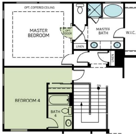
OPTIONAL BEDROOM 4 W/ BATH 4 ILO OPEN TO BELOW