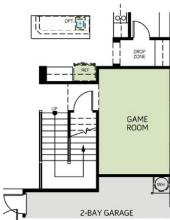
OPTIONAL GAME ROOM IN LIEU OF TANDEM GARAGE